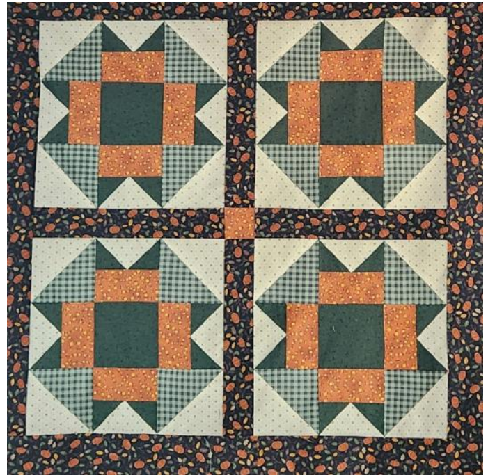
Above: February Pattern

April 15: Irish Chain This quilt block dates back to pre-Civil War era. We will be offering the double Irish Chain with two colors and a background.