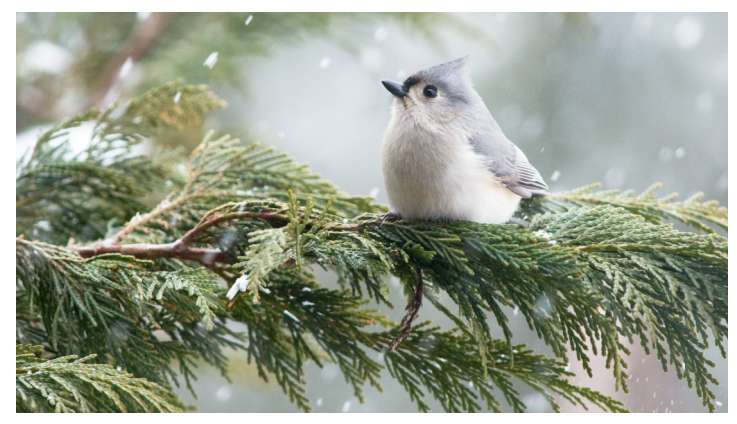
Tufted Titmouse.

Make a pinecone birdfeeder to take home and help the Naturalist count birds who visit the feeders. Come anytime and stay as long as you want to count.