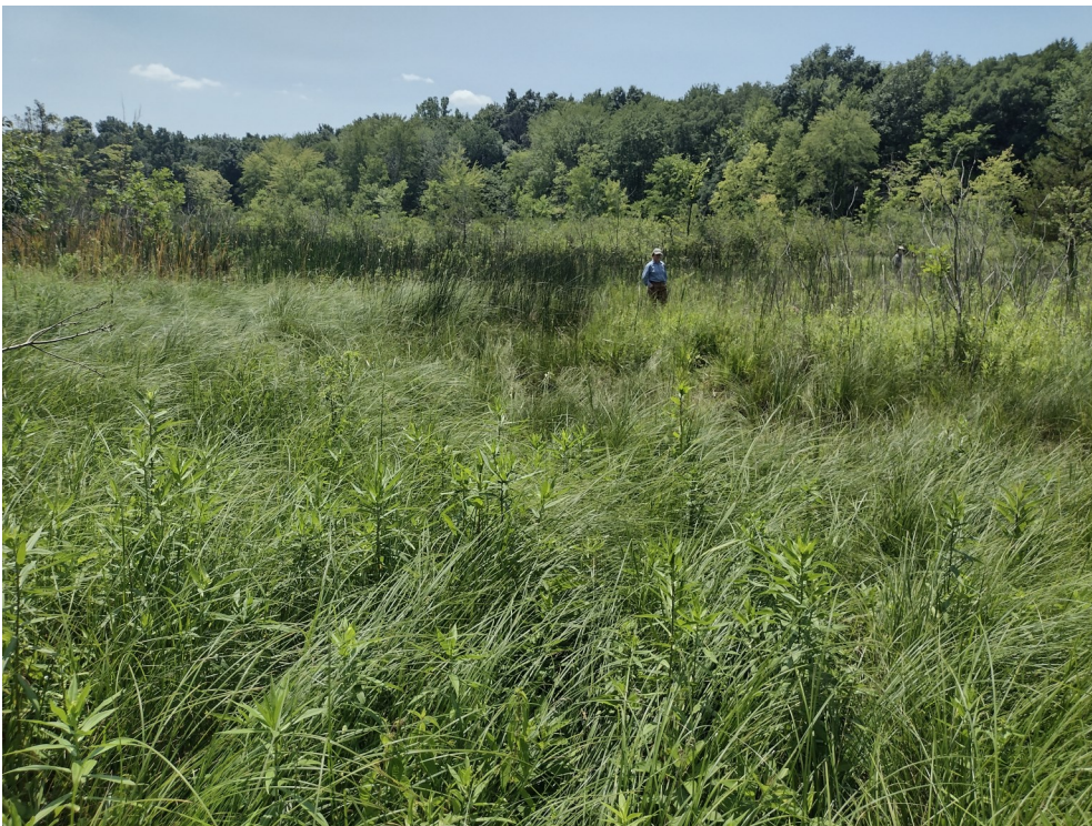
Larimer Fen